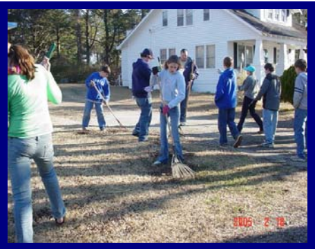
Cleaning up to aid in the opening of a local community center

“Go ye therefore and teach all nations, baptizing them in the name of the Father, the Son, and the Holy Ghost:” Matthew 28:19