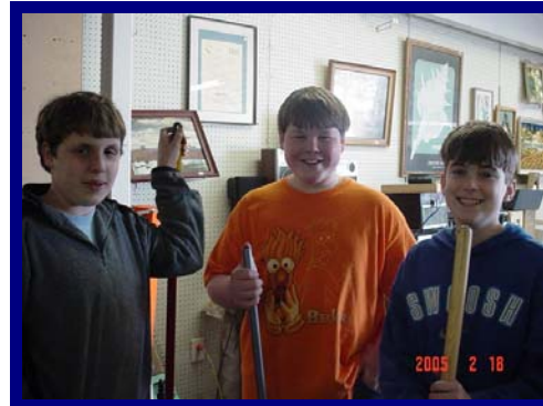
Missions-minded young men ministering to a coastal community by helping to clean up the Thrift Store.