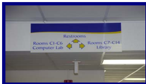
Attractive signs make for easier navigation in the elementary building.