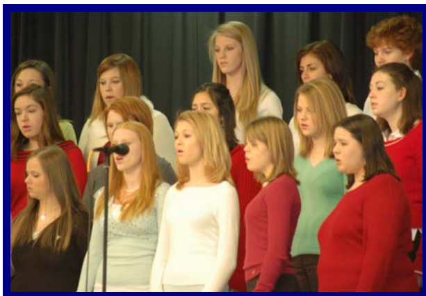
High School Chorus celebrates Christmas in Chapel.

"And whatsoever ye do, do it heartily as to the Lord and not unto men" Colossians 3:23