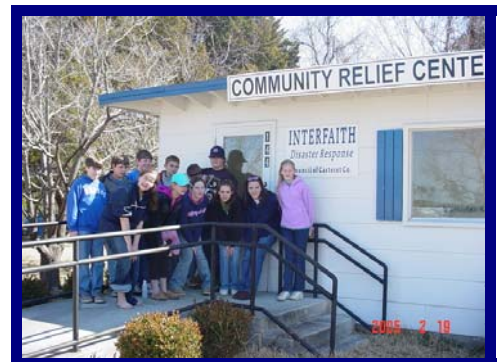
Blessed after a great day for a great job!