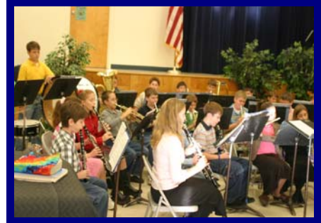
Band students sound forth His glory in Chapel.

The newly organized Fine Arts Booster Club is actively involved in the support of the Fine Arts Department at WCA. Already accomplished in 2005 was fund raising on Super Saturday; assisting with concert decorations; organizing an Evening of Art, a display and auction of many original artwork pieces by WCA students; and publishing a Fine Arts Program featured at all of our concerts.