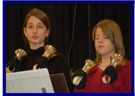
Handbells ring the Christmas story .

"And whatsoever ye do, do it heartily as to the Lord and not unto men" Colossians 3:23