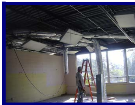
Adding the wiring and duct work for the new central heat and air system