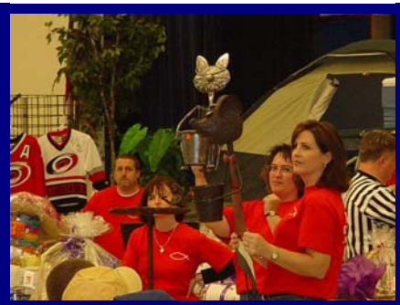
Many volunteers made Super Saturday successful.