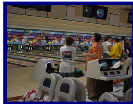
Fun at Buffalo Lanes for the after-school bowling teams