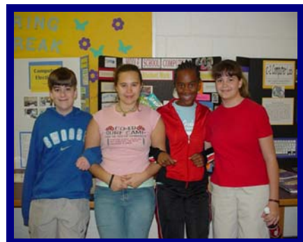
Friends celebrate a job well done with middle school projects completed!