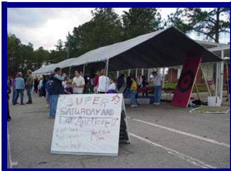
Super Saturday offered fun for the whole family!