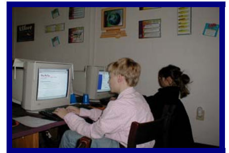
Hard at work in Lab C2