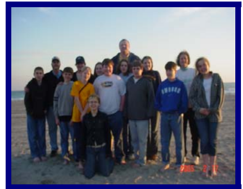
The missions team in Morehead City, NC

“Go ye therefore and teach all nations, baptizing them in the name of the Father, the Son, and the Holy Ghost:” Matthew 28:19