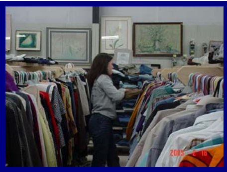
Organizing clothing in the Second Blessings thrift store

We are continually grateful for the way that God continues to work in the lives of our students, alumni, and staff in extending the Kingdom of God throughout this world. We look forward to seeing how God will use each of us in His master plan to reach the world for Jesus Christ.