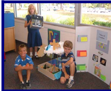
Learning is fun!