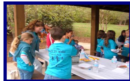
Enjoying lunch during Walk for Wake