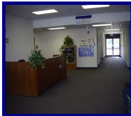
A new lobby greets the WCA family in the C building.