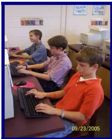
Concentrating in Computer class!

One of the challenges in Christian education is achieving a balance between our educational mission and financial stability. It is for this reason we are enlisting the help of FACTS Tuition Management. FACTS performs electronic processing of your monthly tuition via an automatic bank payment. You will no longer have to mail or drop off a check each month or be concerned with your payment arriving on time. Starting with the May 1 payment for the 2006-2007 school year, WCA will implement the FACTS payment plan. Families that choose to pay on the 10 or 12-month plan will enroll in the FACTS payment service plan. Families that pay in full will submit their payment to the business office no later than May 1, 2006. For additional information visit our website at www.wakechristianacademy.com .