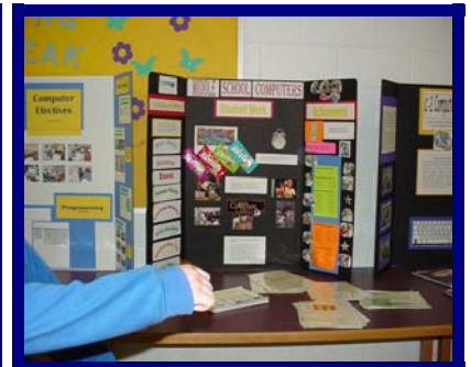
Student work on display during the Academic Expo