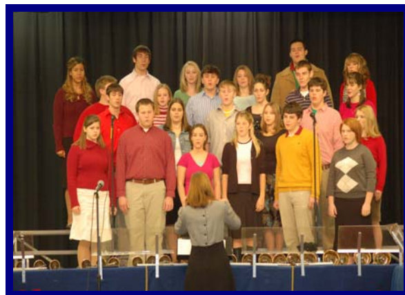
The Chorale lifts their voices in praise to the Lord.